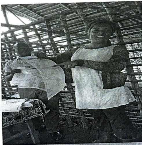
Explanation of the SESRR results